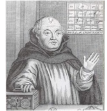
Friar Tetzel would travel around selling indulgences to people.

Tetzel, a friar, sold indulgences. Doctrines of indulgences taught that Christ and the saints had stored up a treasury of merit. Indulgences could reduce the amount of time spent in purgatory; did not bring forgiveness of sin. Indulgences were sold to raise money for the church's increasing expenses. (They were like car salesmen, and lied about them.)